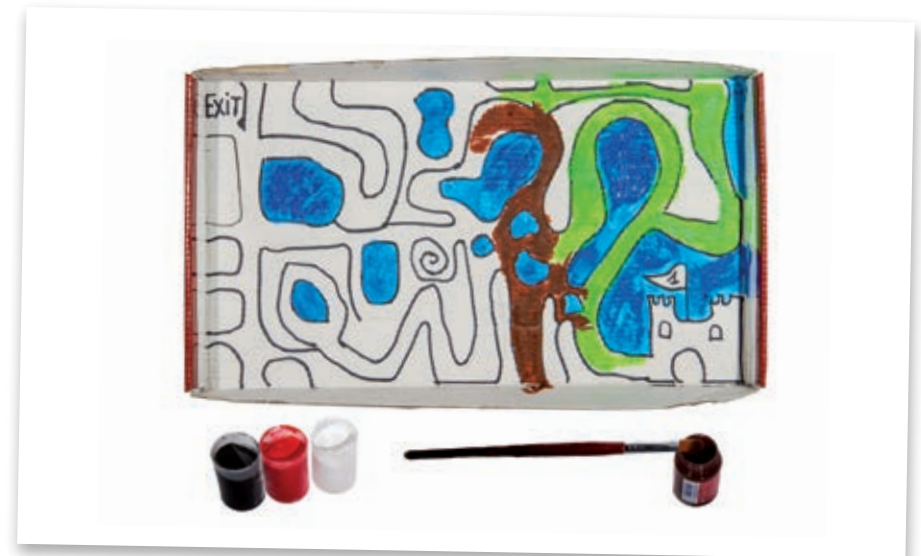
Step 2: Paint your maze.