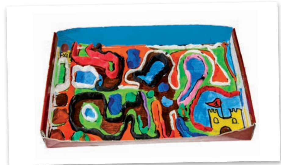
Step 4: Add other obstacles and play with marbles.