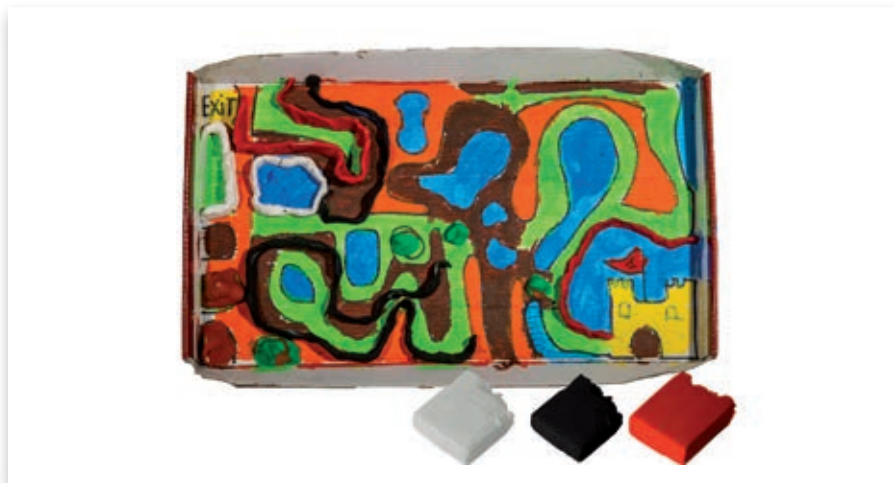
Step 3: Build the maze walls with plasticine.