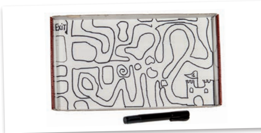
Step 1: Design and draw a maze inside a shoebox.