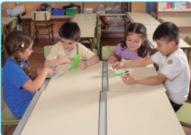
3. Show your doll to a classmate.