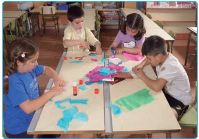
2. Decorate your doll.