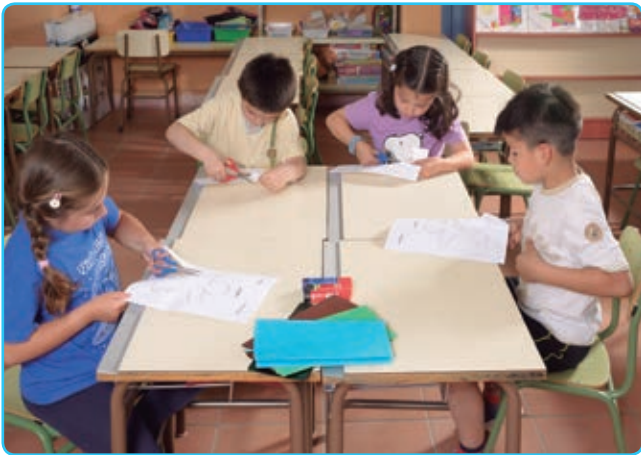
1. Cut out your doll.