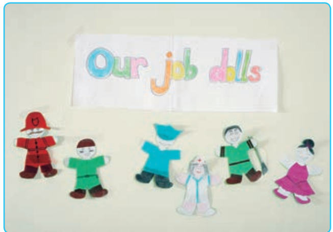
4. Display your doll.