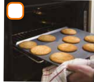
b They were in the oven.